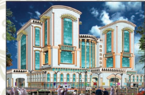
Hospital At Jeddah