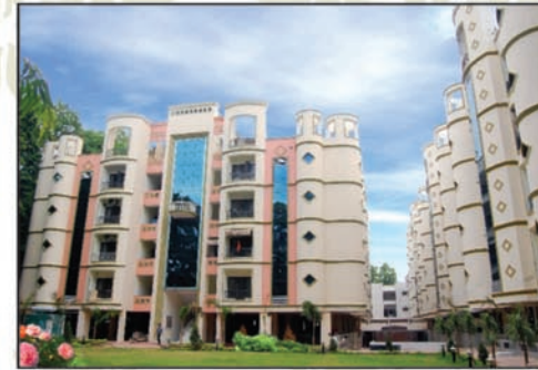
Empire Estate Residency 20 Mall Avenue