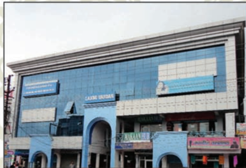
Laxmi Vardhan Complex, Patrakar Puram Crossing, Gomti Nagar