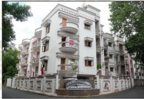
Gee Cee Enclave 19 Mall Avenue