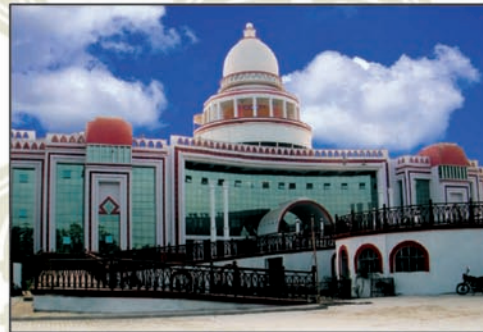
Convention Center, K.G.M.U. Lucknow